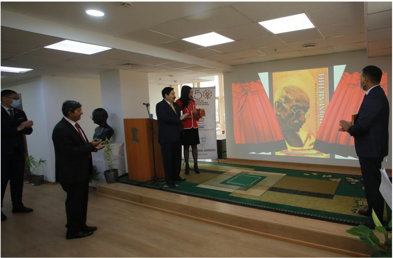
Gandhi Jayanti was also celebrated by Representative Office of India in Almaty.