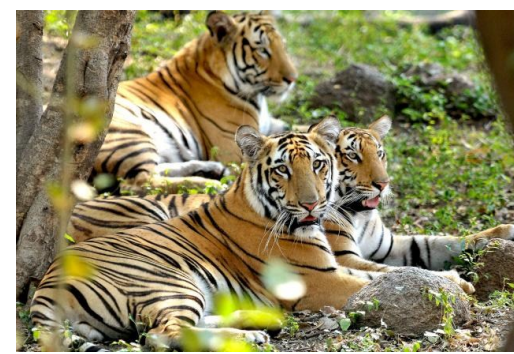
Nehru Zoological Park