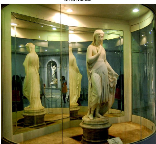
Statute of Veiled Rebecca in Salar Jung Museum