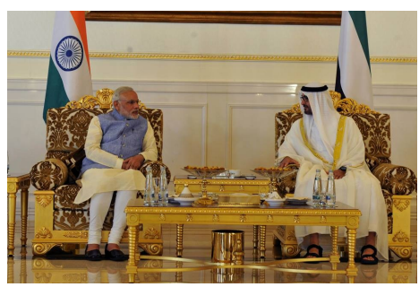
Prime Minister meets Crown Prince of Abu Dhabi

The two sides agreed to elevate the India-UAE relationship to a comprehensive strategic partnership. They agreed to denounce and oppose terrorism in all forms and manifestations calling on all states to reject and abandon the use of terrorism against other countries, dismantle terrorist infrastructure and bring perpetrators of terrorism to justice. They vowed to strengthen cooperation in various fields such as trade, education, energy, space, peaceful use of nuclear energy, counter terrorism operations, maritime security, cyber security, law enforcement, anti-money laundering, drug trafficking and other transnational crimes. They agreed to cooperate in manufacture of defence equipments in India and establish a strategic security dialogue between the two governments. The two leaders also agreed to facilitate participation of Indian companies in infrastructure development in UAE and encourage