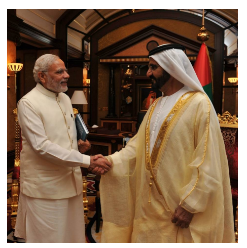
PM with VP and PM of UAE and Ruler of Dubai

the investment institutions of UAE to raise their investments in India including through establishment of UAE-India infrastructure Investment Fund for US$ 75 billion.