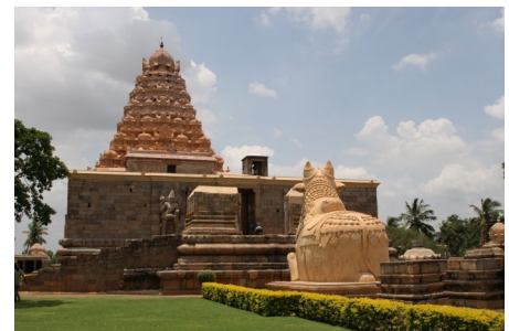
Gangai Konda Cholapuram