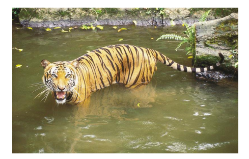
Royal Bengal Tiger