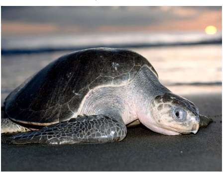
Ridley Sea Turtle