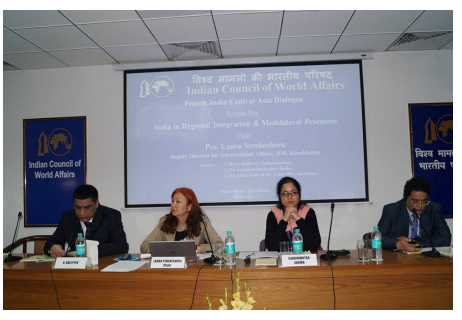
Embassy of India