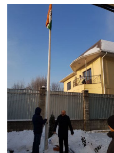
Celebration of the 69th Republic Day of India in Astana