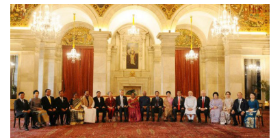
President of India Meets ASEAN Leaders