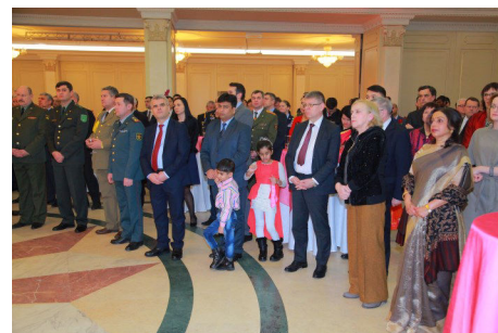
Celebration of the 69th Republic Day of India in Almaty