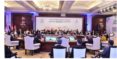
Plenary Session of ASEAN-India Summit

Prime Minister Hun Sen attended a Business Meeting organized by FICCI. He visited the Centre of e-Governance of the Ministry of Electronics and IT and expressed appreciation of India's IT applications in the field of agriculture. Prime Minister Modi expressed India's willingness to assist Cambodia in agriculture-related IT applications including Soil Health Cards for farmers and establishment of electronic National Agriculture Market. Four agreements were signed during the visit on Cultural Exchange Programme, Line of Credit for US$ 36.92 million to finance Stung Sva Hab Water Resource Development Project, Mutual Legal Assistance in Criminal Matters and Prevention of Human Trafficking.