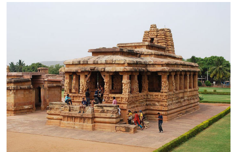
Aihole Durga Temple