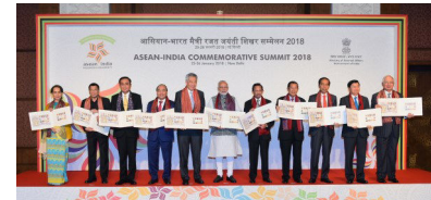
Leaders Release Commemorative Stamps