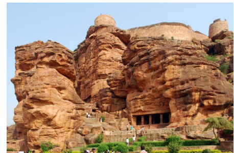
Badami Cave Temples