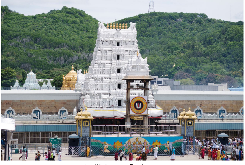
Lord Venkateswara Temple

Swami Pushkarini Lake, Sri Govindaraja Swami Temple, Kapila Theertham Waterfalls, Padmavati Temple, Alamelumanga Temple, Narayanavanam and Kailasanathakona Waterfalls are some of other major tourist attractions in and around Tirupati.