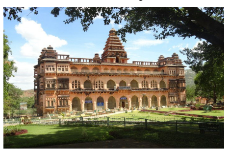
Raja Mahal in Chandragiri Fort