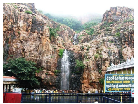
Kapila Theertham Waterfalls